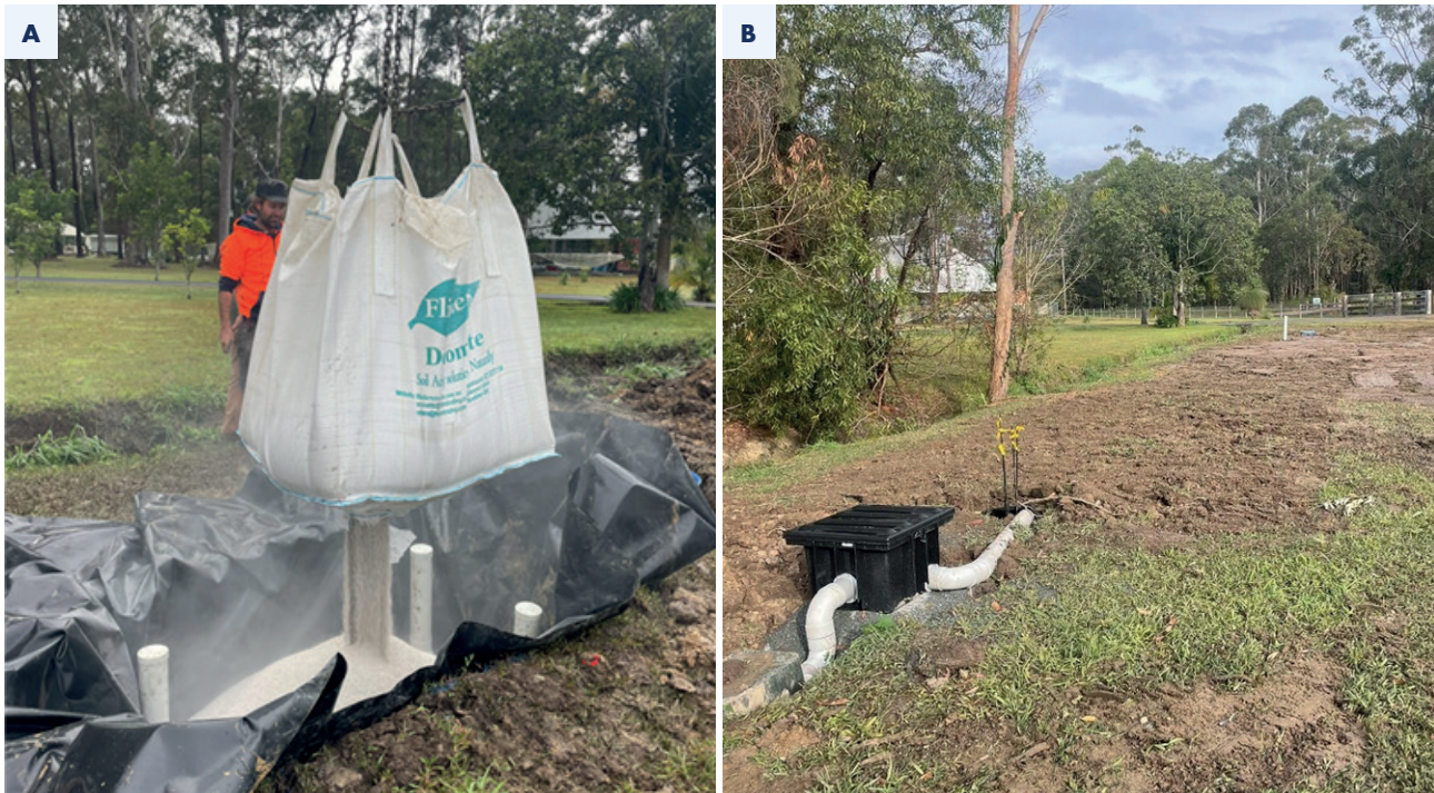
Figure 5. A second pit 0.7m deep, 2.4 m long and 1.5m wide was dug and filled with dolomite to create a phosphate filter (A). Both the bioreactor and phosphate filter were covered up with top soil to allow the grass to regrow (B)