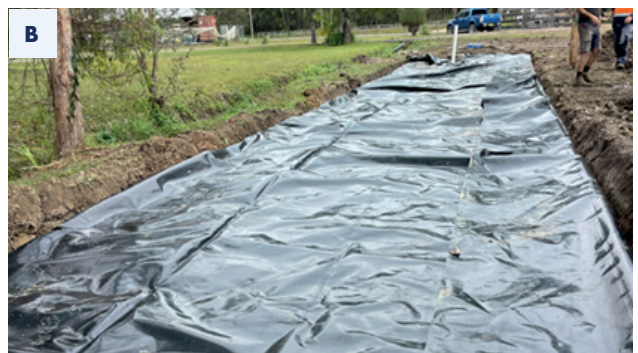
Figure 4. The pit was filled with hard wood chip (A) and enclosed with the thick black plastic (B)