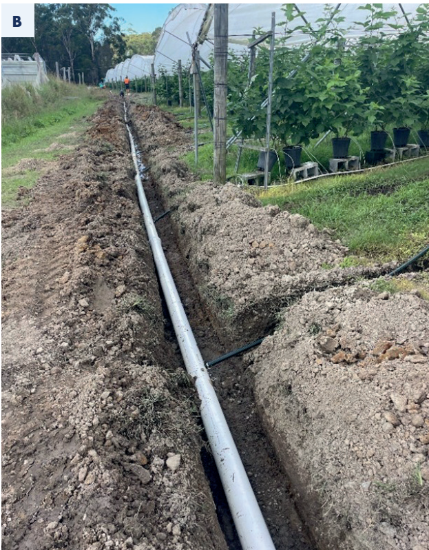
Figure 2. Raspberry pots were drained into a gutter capture system (A) to direct runoff into the bioreactor (B) Piping installation transferring runoff to the bioreactor