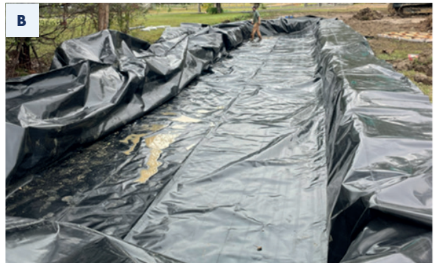
Figure 3. Construction of the bioreactor involved digging a pit 25m long x 4m wide x 0.6m deep (A) and lining it with thick black plastic (B) to prevent seepage of the runoff