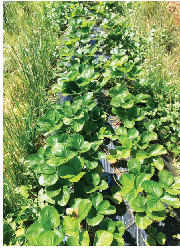
The same site in early 2020, showing healthy plants and inter row plantings of barley and ryegrass

WINTER 2020 AUSTRALIAN BERRY JOURNAL EDITION 3