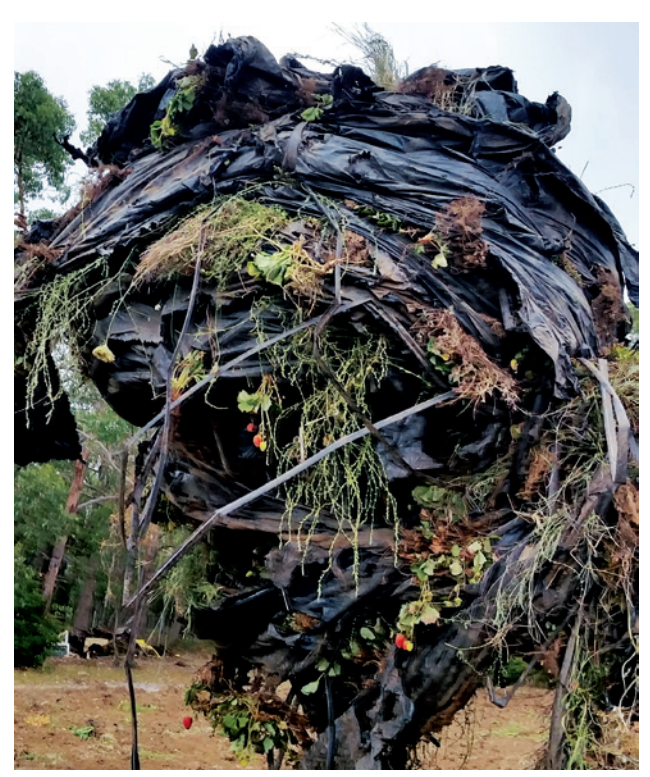
Plastic mulch containing entire strawberry plants