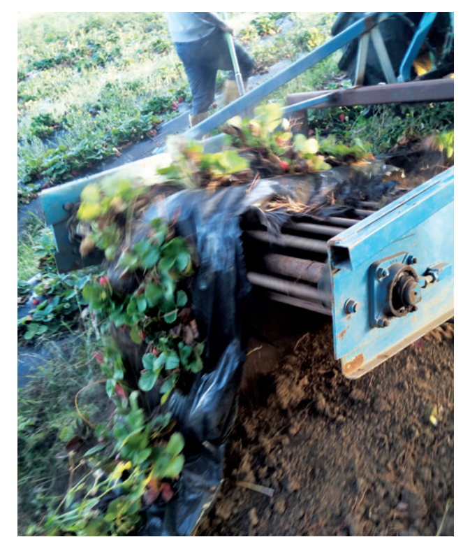
Modified garlic digger lifting plastic and plants, including the crowns.