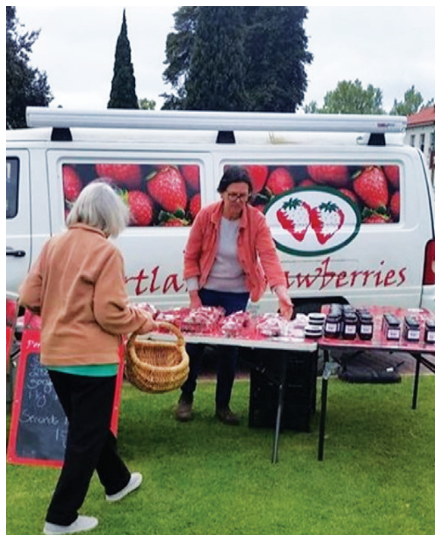
One of Portland Strawberries' vans that service towns in Western Victoria and South Australia

Several recommendations were made for managing Charcoal Rot as part of the Victorian project, including increasing on farm hygiene and biosecurity, removing diseased plants & old crowns from paddocks, and reducing stress, particularly in hot weather, by ensuring plants are well irrigated.