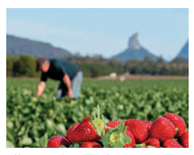
Ashbern Farms' site at Beerwah.

Through all the crazy times in recent years, Hamish has been a calm and steadfast support as Ashbern Farms navigated through the various crises and adapted to accommodate any changes needed.