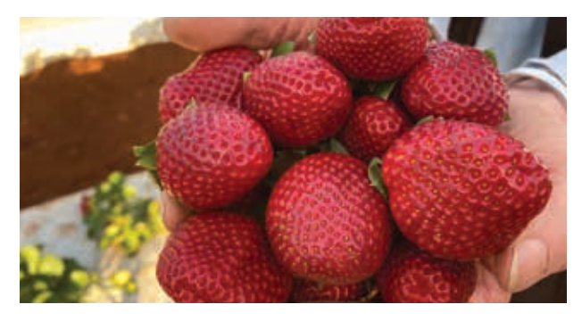
Fabulous strawberries at Tinaberries in Bundaberg

Tina is a fantastic advocate for the industry and is the "go to" person for local media to highlight the start of the strawberry season, generate consumer interest in strawberries, encourage community support for the industry and inspire increased consumption. The locally famous farm gate store that is open all year round, incorporating a highly successful "pick your own" feature during winter and spring has helped to elevate the business to being one of the top tourism ventures in the area. One visitor on Trip Advisor described the farm as a "Wonderful, authentic farm experience which is truly 'Paddock to Plate' with welcoming, friendly owners and staff" and a growing reputation for producing ice cream described by many as "the best they have ever eaten".