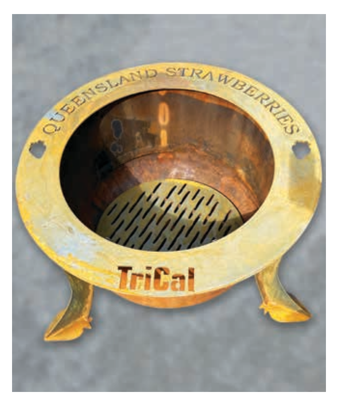
Strawberry fire pit