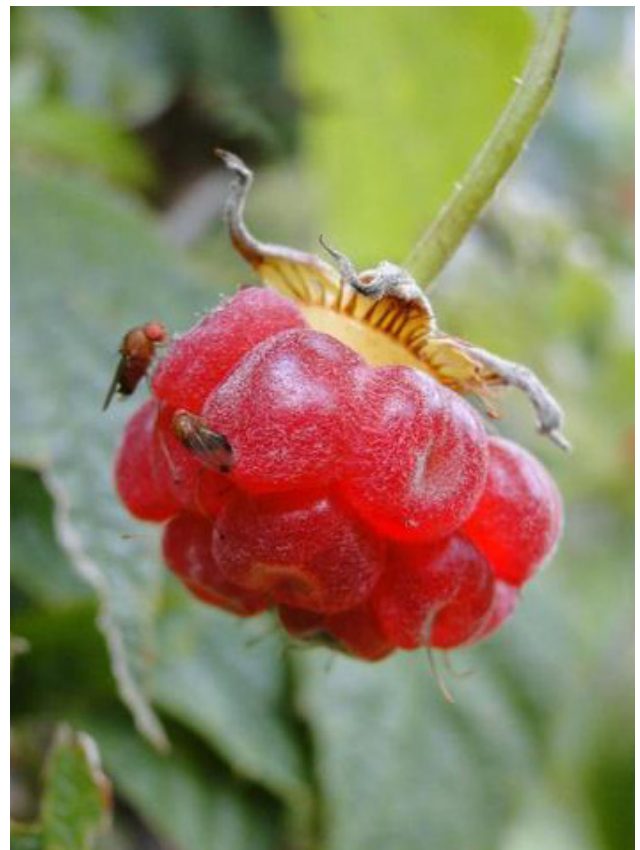
SWD on raspberry in the United States.

Let's remind ourselves of what SWD is capable of doing to soft fruit crops once it is established in an area by looking at data from other regions. While losses in the US and Europe as high as 80% have been reported among Rubus, strawberry and cherry crops, production losses of 20-40% on affected farms are more common.